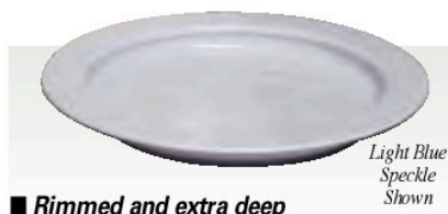
Light Blue Speckle Shown